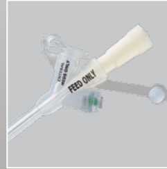
Balloon retention gastrostomy tube