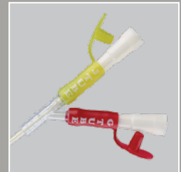
PEG jejunal feeding tube