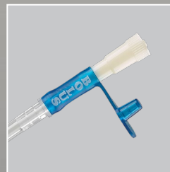
Bolus PEG tube adapter