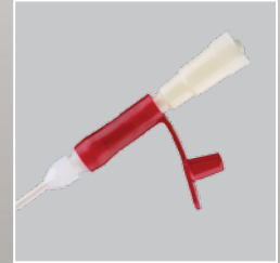
Nasoenteric feeding tube