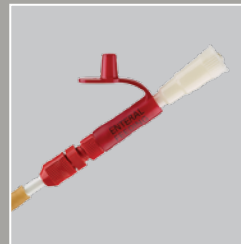
Locking-loop feeding tube