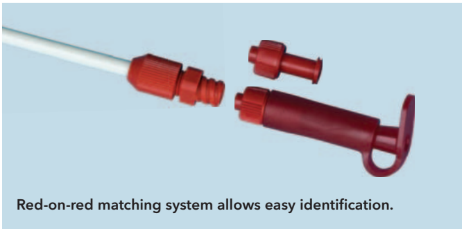
Red-on-red matching system allows easy identification.